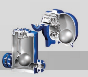
Mechanical pump systems CONLIFT®, CONA® P

Profit from diversity made by ARI. Please don't hesitate to ask for more information!